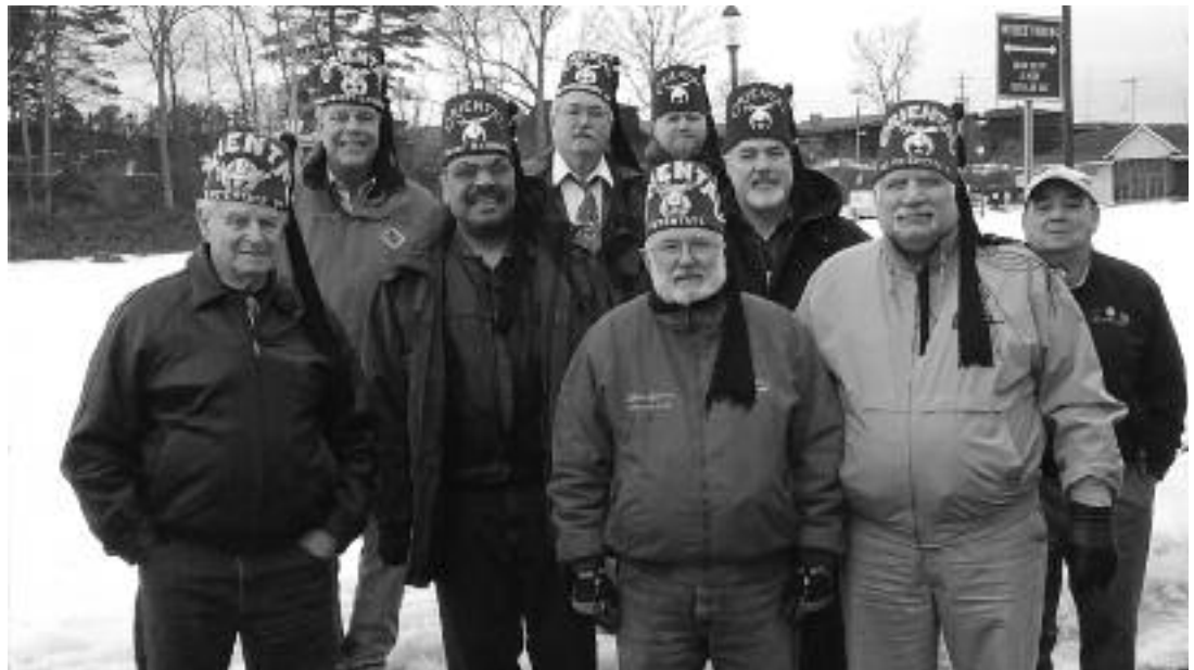
Oriental Shriners at the St. Patrick's Day Parade in Lake George.