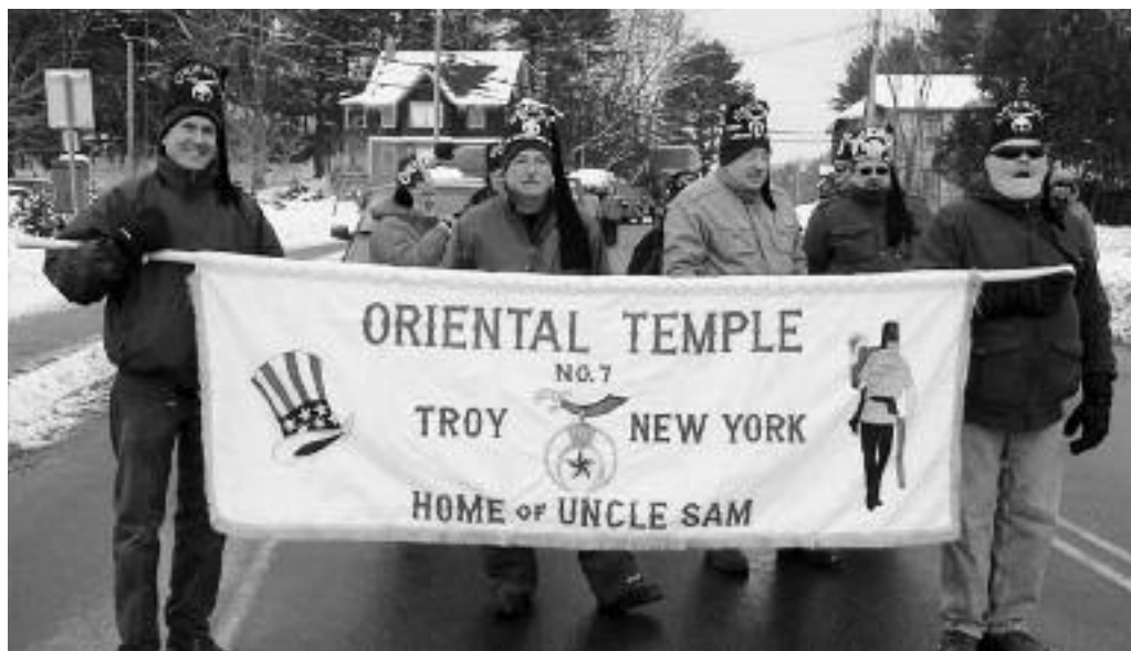
ORIENTAL SHRINERS MARCH IN SARANAC PARADE