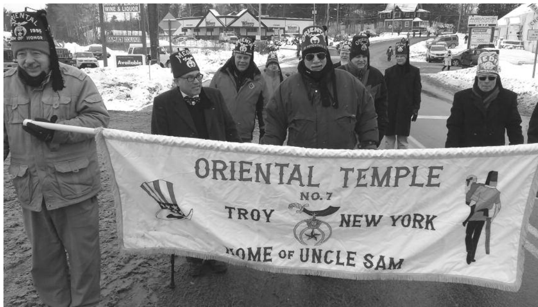
Oriental and Media Shriners march in Saranac Winter Carnival Parade.