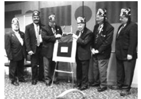
Representatives from Oriental at plaque unveiling.