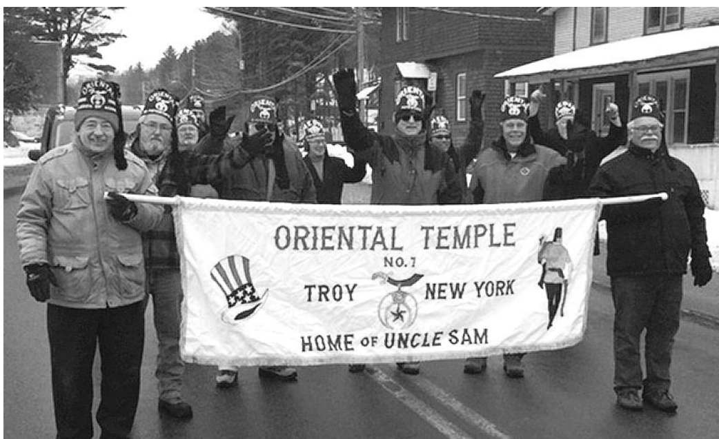
Oriental and Media Shriners march in Saranac Winter Carnival Parade.