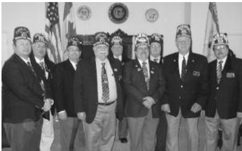
2012 ORIENTAL OFFICERS