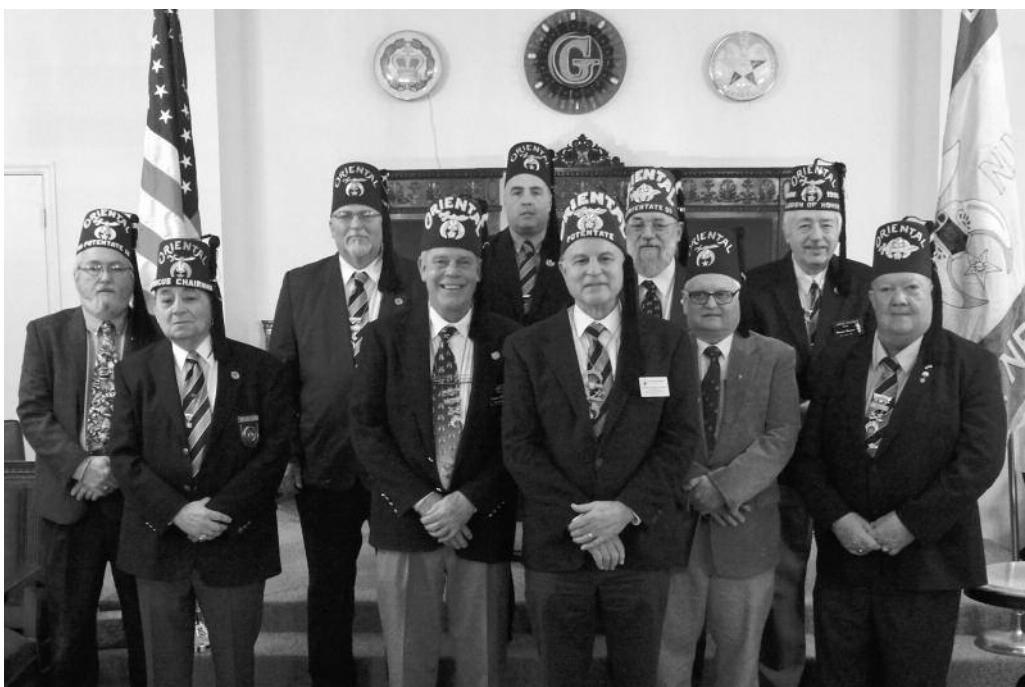
2017 ELECTED AND APPOINTED OFFICERS