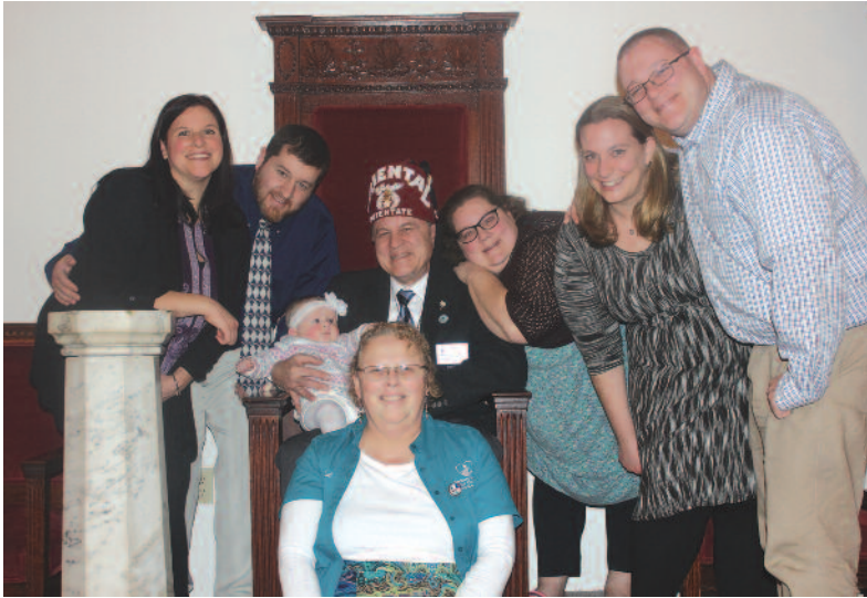
Family, Fun and Fraternity