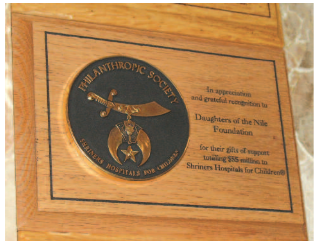
Nile wall plaque