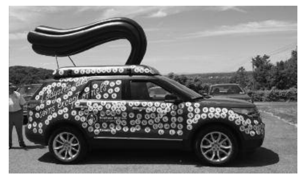
L'Odyssée Van comes to Troy from Canada.