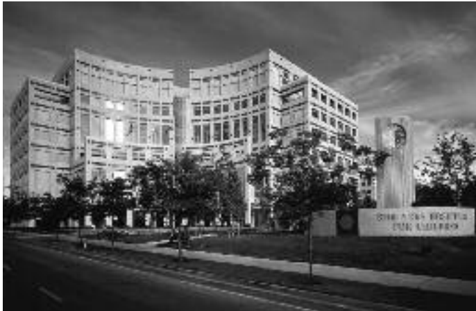
Shriners Hospitals for Children — Northern California

Every year, U.S. News & World Report surveys hospitals across the nation and then ranks the top providers in 10 care disciplines, including cardiology and heart surgery, orthopaedics, diabetes, and endocrinology. Being ranked in the magazine's annual survey is a distinction given to only 80 children's hospitals in the country.