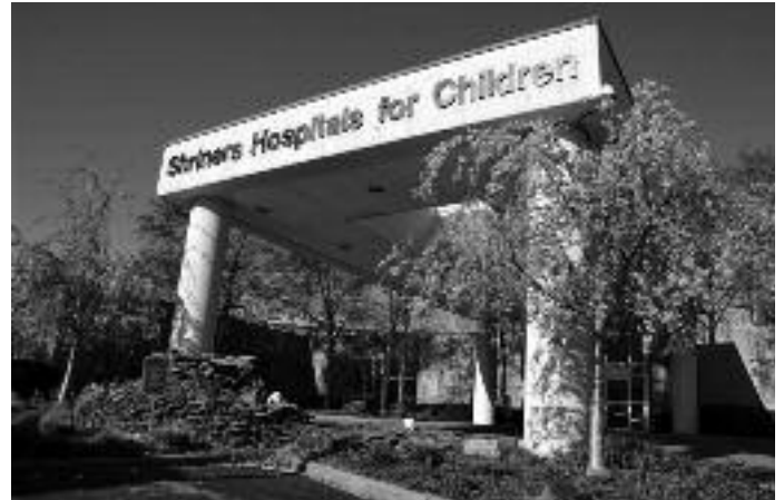
Shriners Hospitals for Children — St. Louis

Shriners Hospitals for Children — Northern California was also recognized as a leader in pediatric orthopaedic care and was ranked number 41 in the top 50 pediatric orthopaedic programs in conjunction with University of California Davis Children's Hospital. "The rankings are a reflection