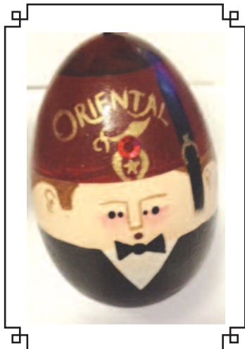
Hand-painted on wooden hen's egg